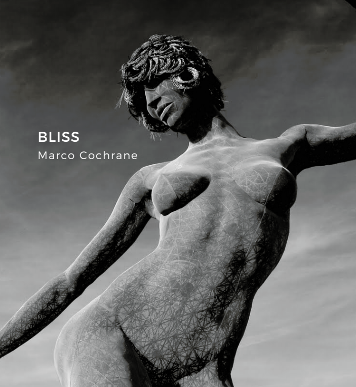
BLISS Marco Cochrane